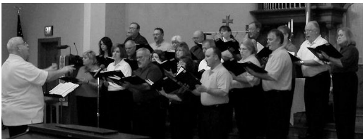
Sonshine Singers from Fort Dodge area.