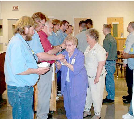
Worship Service at one of the prisons