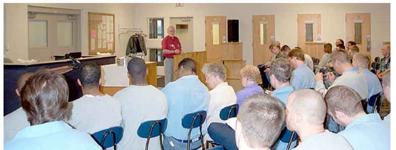
Worship Service at one of the prisons

Of the six ministries listed in Matthew 25 that are important to Jesus, visiting those who are in prison often stumps congregations. The Church of the Damascus Road provides Western Iowa Synod congregations the opportunity to extend their ministries into prison and to "do to the least of these my brothers," therefore ministering directly to Jesus.